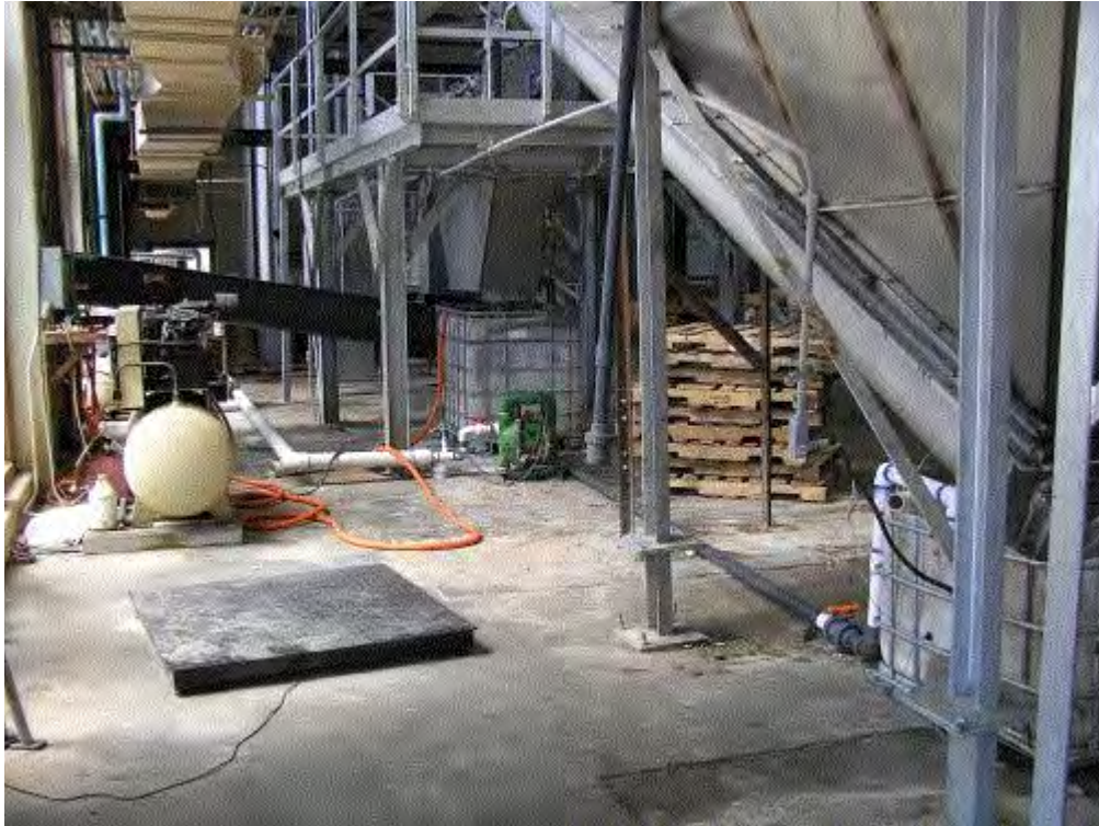
Image 8(008) : Depackager at center, with bin for waste packaging underneath.