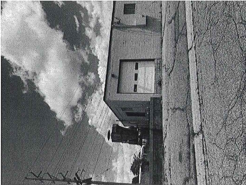
Image 2(Cyclone) : Cyclone disconnected. This image should be viewed one turn clockwise.