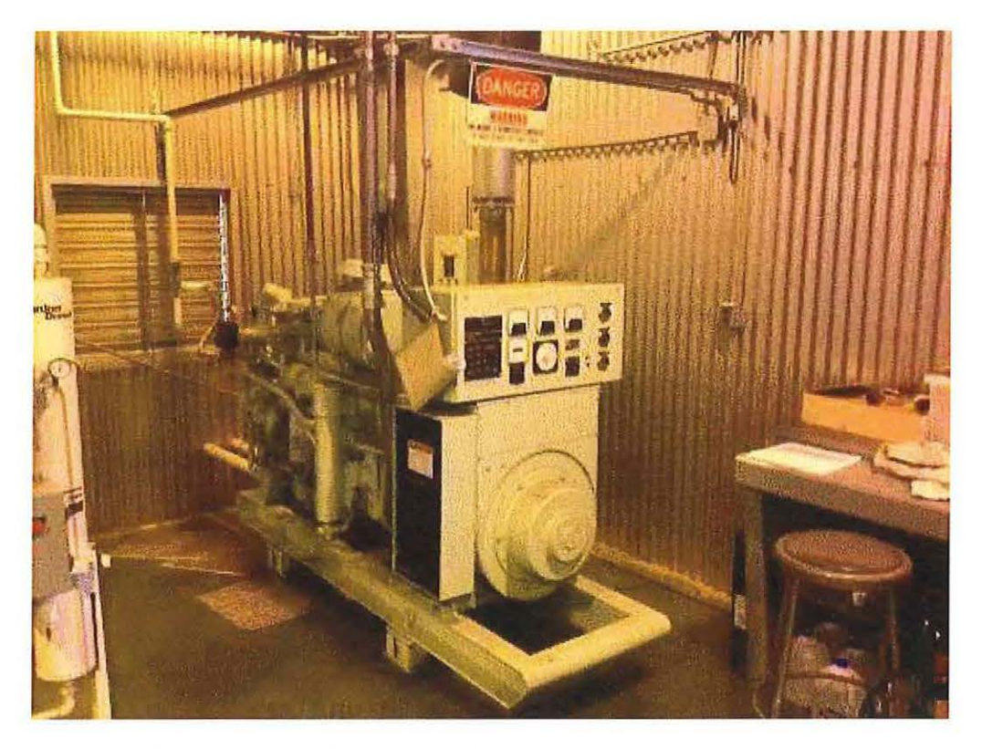
Image 2(GLGT10A2) : Emergency generator APU operates on natural gas