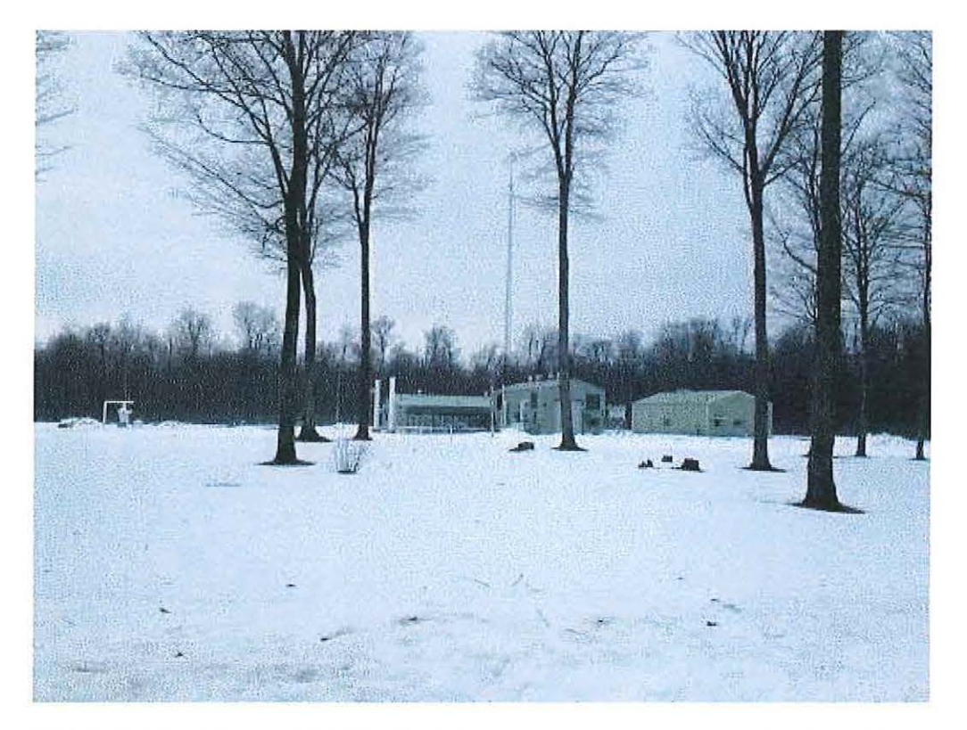
Image 1(GLGT10A1): View of GLGT facility 10A unmanned compressor station from driveway gate.

No violations of PTI #'s 241-80 were observed at the time of this inspection and the facility appears to be in compliance with the permit.