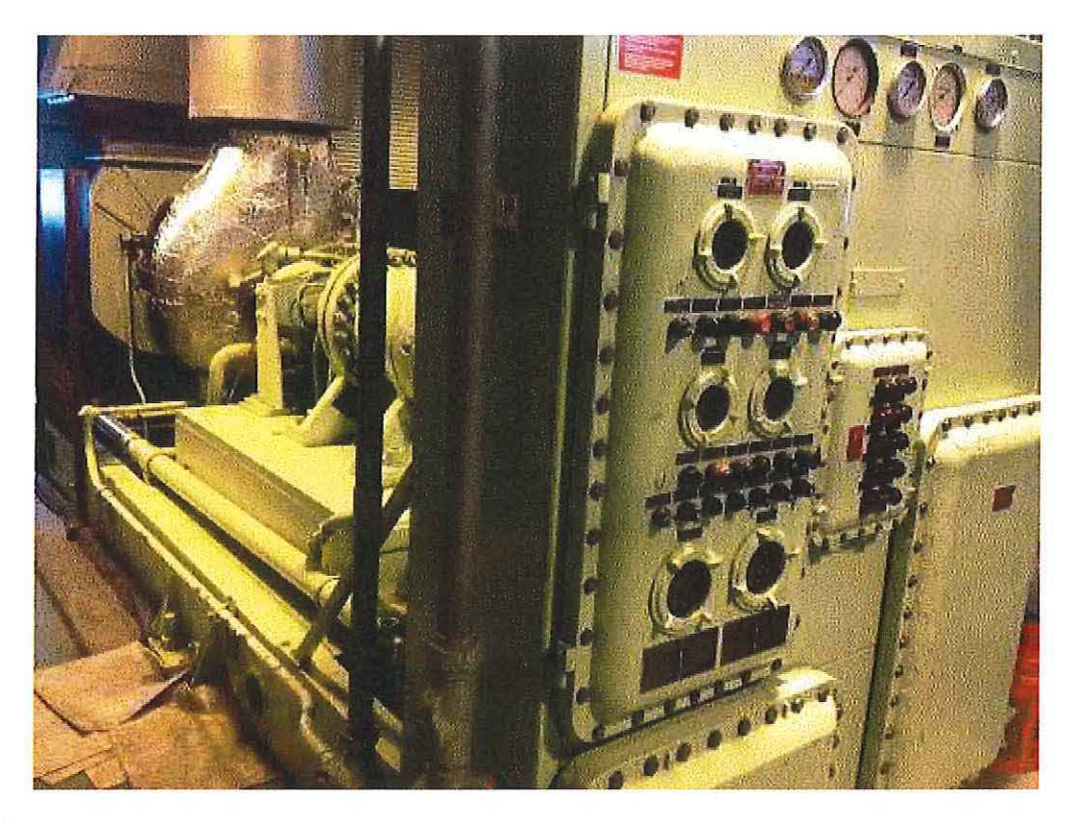
Image 4(GLGT10A4) : Unit 10A02 natural gas turbine pressure generator