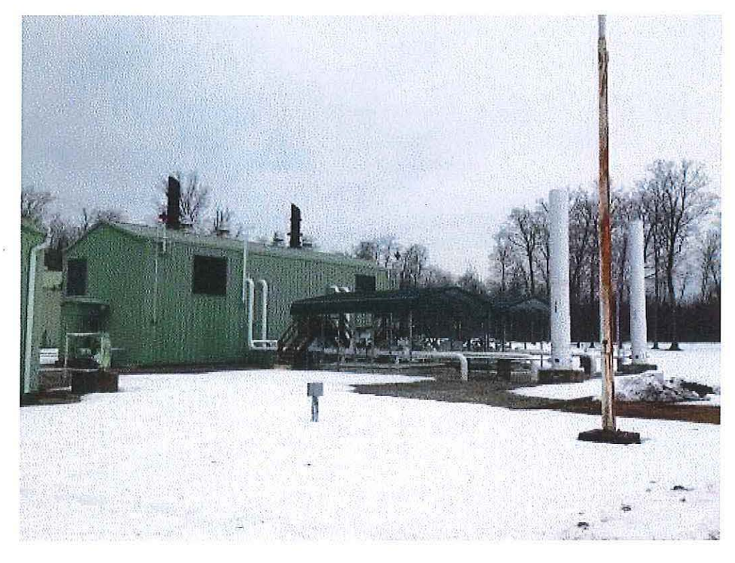
Image 6(GLGT10A6) : Exterior of structure housing turbines--black stacks