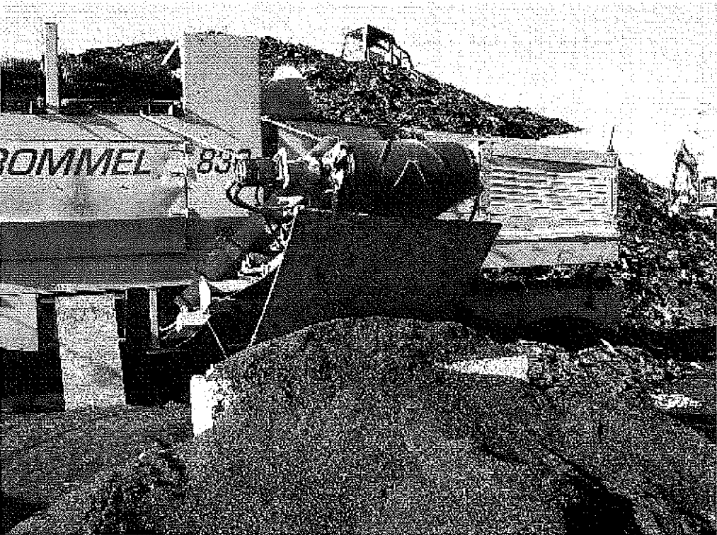
Image 4(Photo 4) : Pile of 1/4" minus material, which is used by the Hot Mix Asphalt industry.