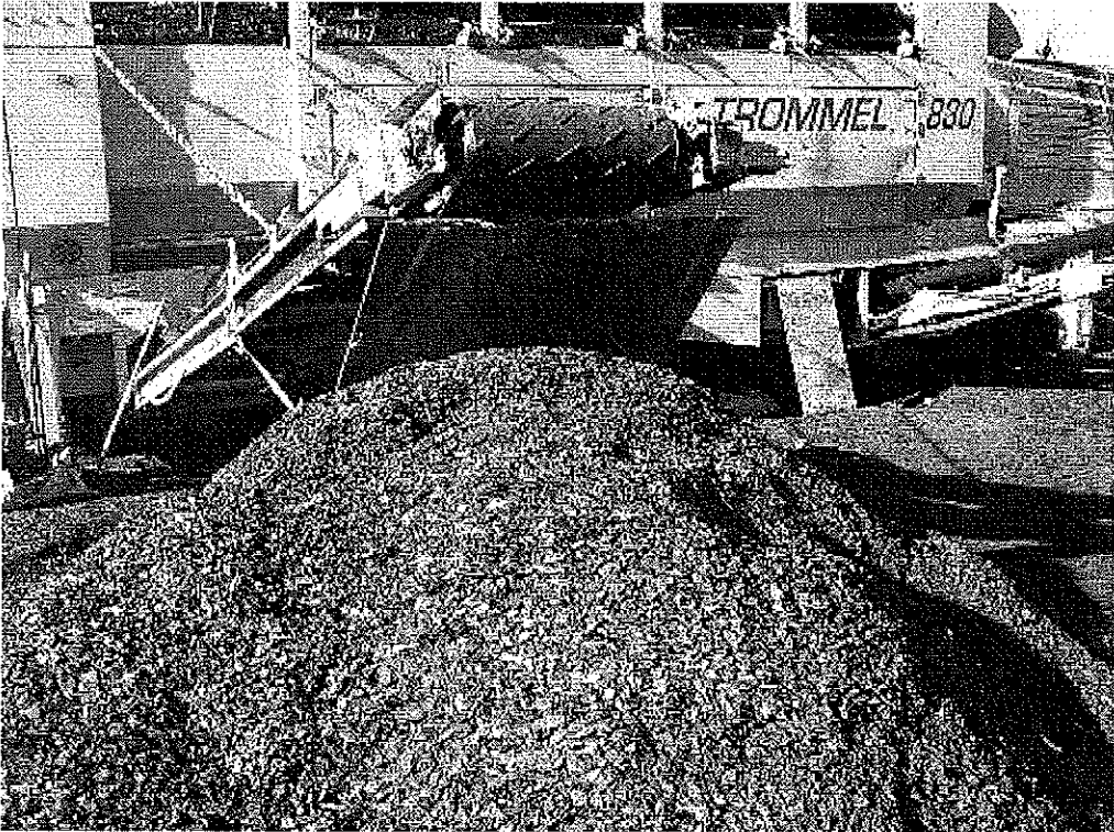
Image 3(Photo 3) : Processed chips, the larger of the two sizes they make.