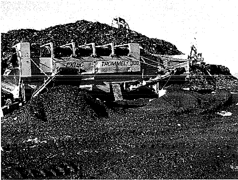
Image 1(Photo 1) : Trommel, with pile of unprocessed shingles in background.