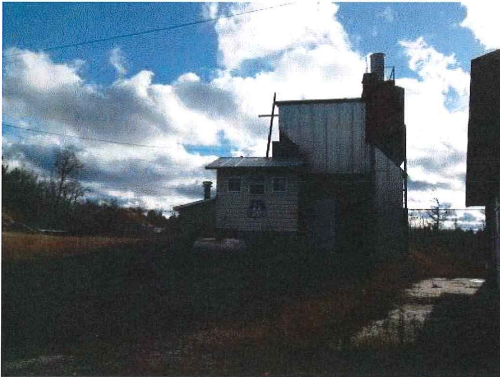
Image 1(MC1) : Front of facility from M-38 (Greenland Road). Offices are in the building frame right.