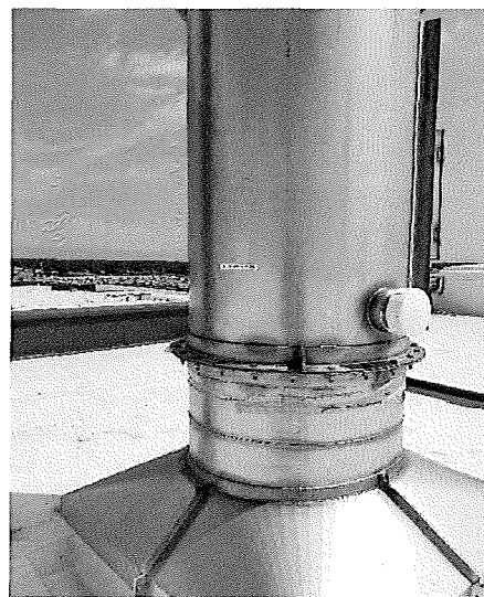
Figure 3.1.1.2 – Basecoat Observation Zone Exhaust

RECEIVED APR 13 2022 AIR QUALITY DIVISION