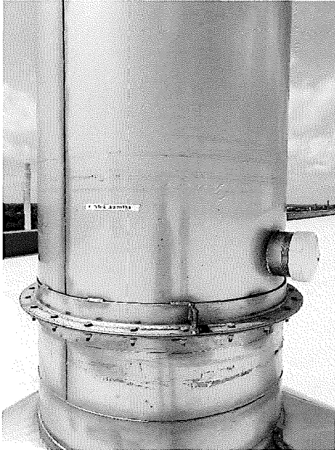
Figure 3.1.1.3 – Clearcoat Observation Zone Exhaust