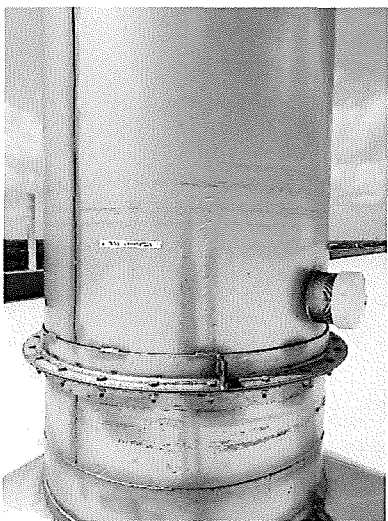
Figure 3.1.1.1 – Tutone Observation Zone Exhaust

Example photos of sources are provided below: