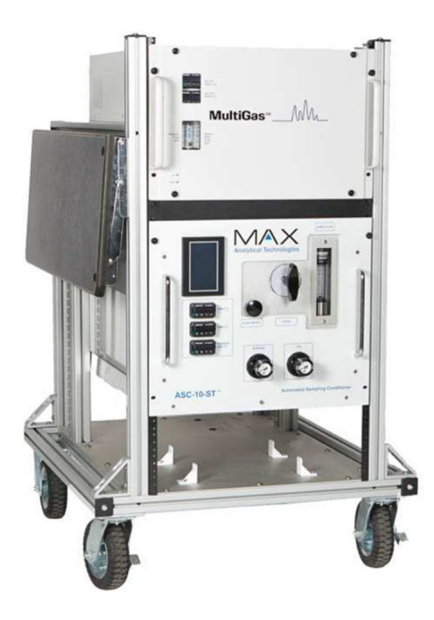
Figure 1: MKS MultiGas 2030 FTIR and ASC-10ST

For oxygen measurement, prior to testing, sample system bias checks and instrument linearity checks (calibration error) were completed. In addition, the analysers were calibrated (zeroed and span checked) at the completion of each run. A data logger system programmed to collect and record data at 1- second intervals was used to compute and record one-minute average concentrations.