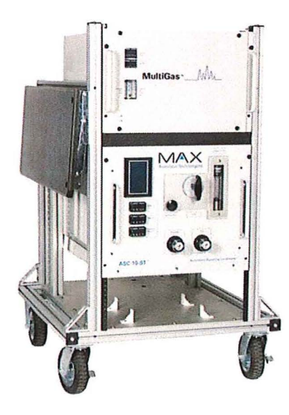
Figure 1: MKS MultiGas 2030 FTIR and ASC-10ST

For oxygen measurement, an EPA Method 3A compliant Brand Gaus Model 4710 wet O<sub>2</sub> analyzer was used. Prior to testing, sample system bias checks and instrument linearity checks (calibration error) were completed in compliance with EPA Method 3A. In addition, the analysers were calibrated (zeroed and span checked) at the completion of each run. A data logger system programmed to collect and record data at 1- second intervals was used to compute and record one-minute average concentrations. The average was drift corrected using pre and post drift checks and changed from wet to dry using stack moisture content.