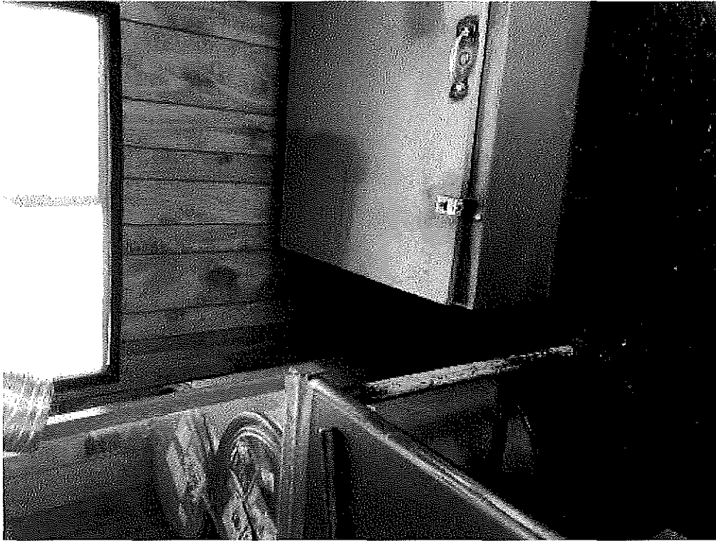
Image 3(Chemical Storage) : The drums on the left contain OC and CS back-up product, and the locked metal box on the floor contains OC and CS currently in use.