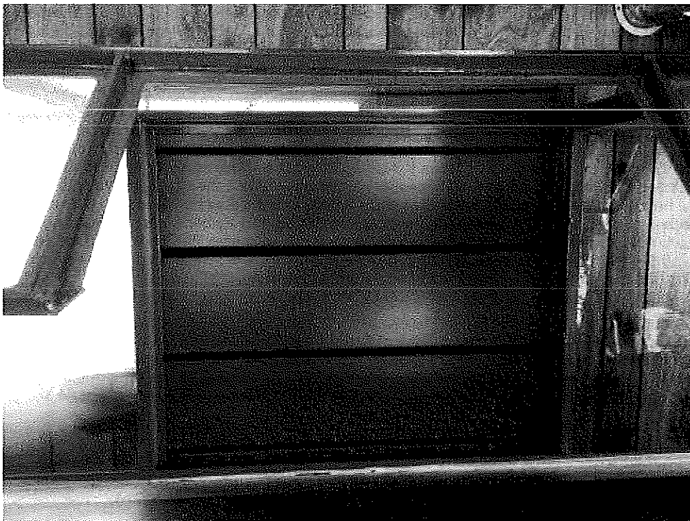
Image 2(Vent) : The vent behind the work station and under glass that connects to the two-stage filtration system outside.