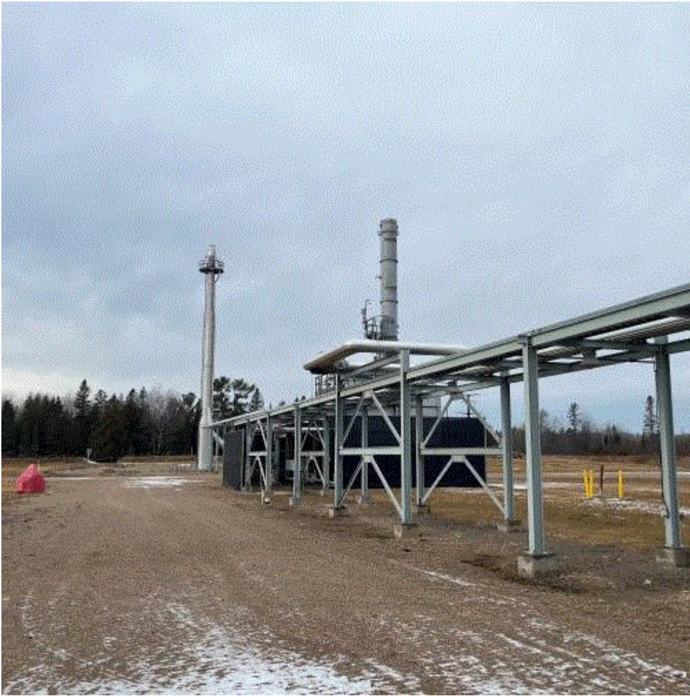
Image 3(Stacks) : EUFLARE (left) and EUHOTOILHEATER (right) stacks.