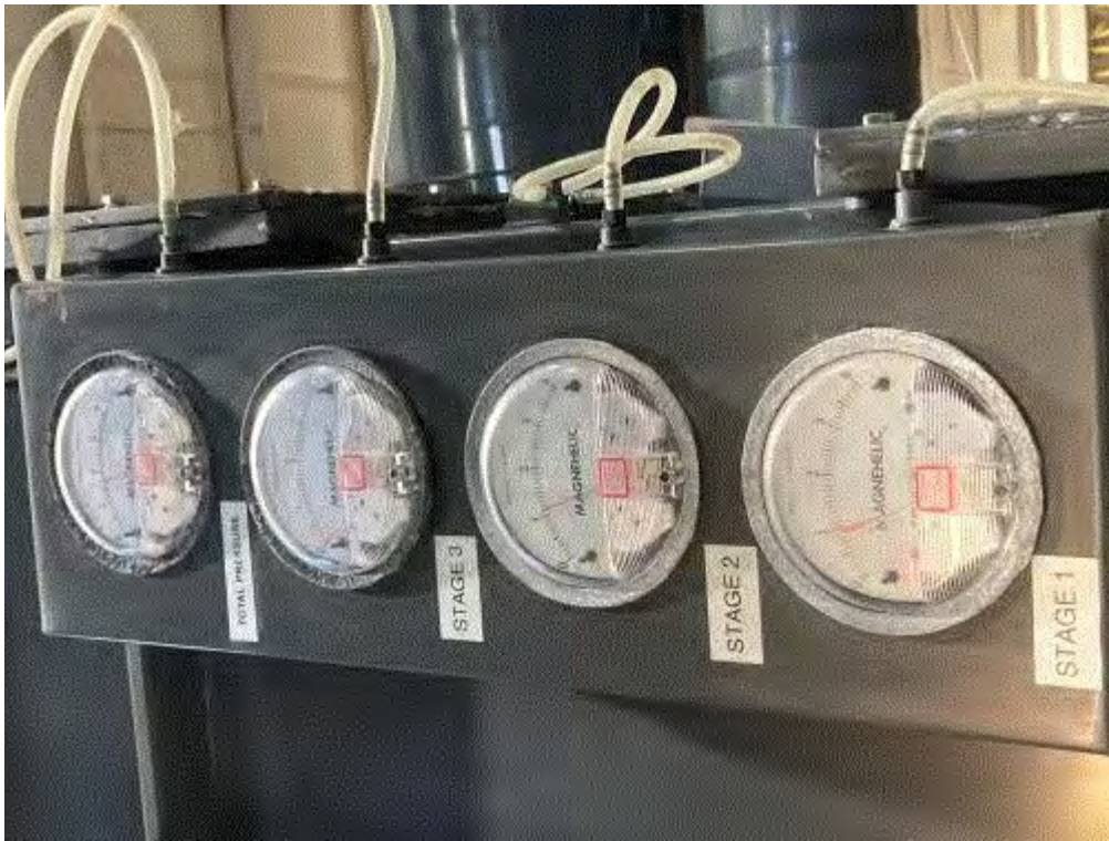
Image 4(Enforcer III - 1) : Pressure gauges on the control device that controls emissions from 3 anodizing tanks. Top guage is total pressure.