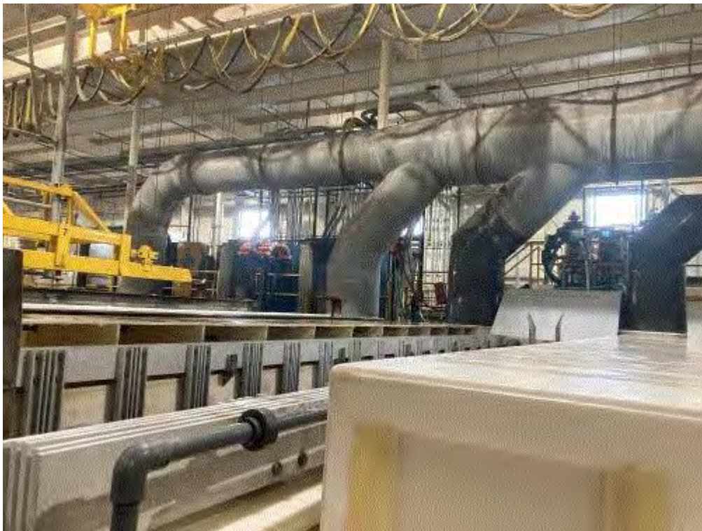
Image 2(Ductwork) : Ductwork coming off of each of the permitted anodizing tanks, routing acid gas to Enforcer III control device.