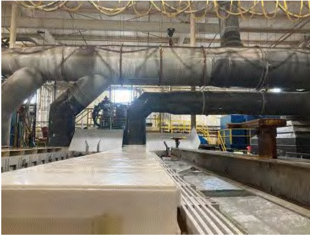
Image 3(New vs Old Ductwork) : Note the lower ductwork system appears newer with newer metal clamps - this routes acid gas from the new anodizing tank #4 to its own control device. Older ductwork is above this, with surface-rust metal clamps.