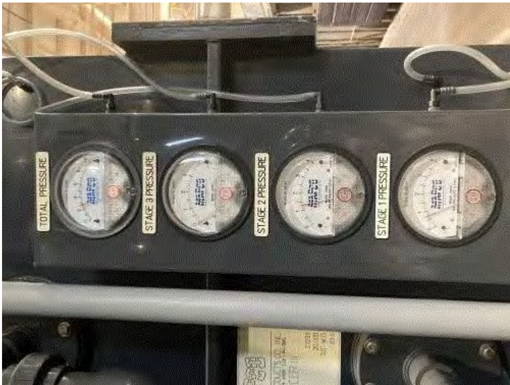
Image 5(Enforcer III -2) : Pressure drop gauges for the new anodizing tank #4. Top guage is total pressure.