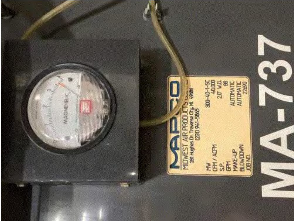
Image 6(MW-300) : Pressure drop guage on caustic, EUETCHSTRIP, control device.