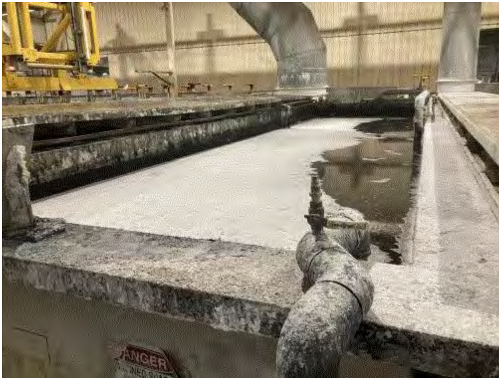
Image 1(NaOH caustic etch) : Caustic etch tank. Note the baffles just above the solution's surface - pulls vapors from surface interface to control device, MW-300.