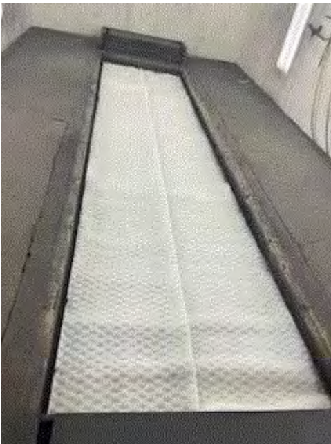
Image 4(New filter) : New filters installed. Note gaps around edges of exhaust vent.