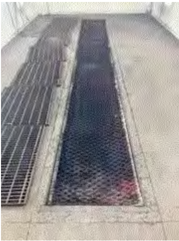
Image 3(Other used filter) : Photo of filters taken prior to changeout.