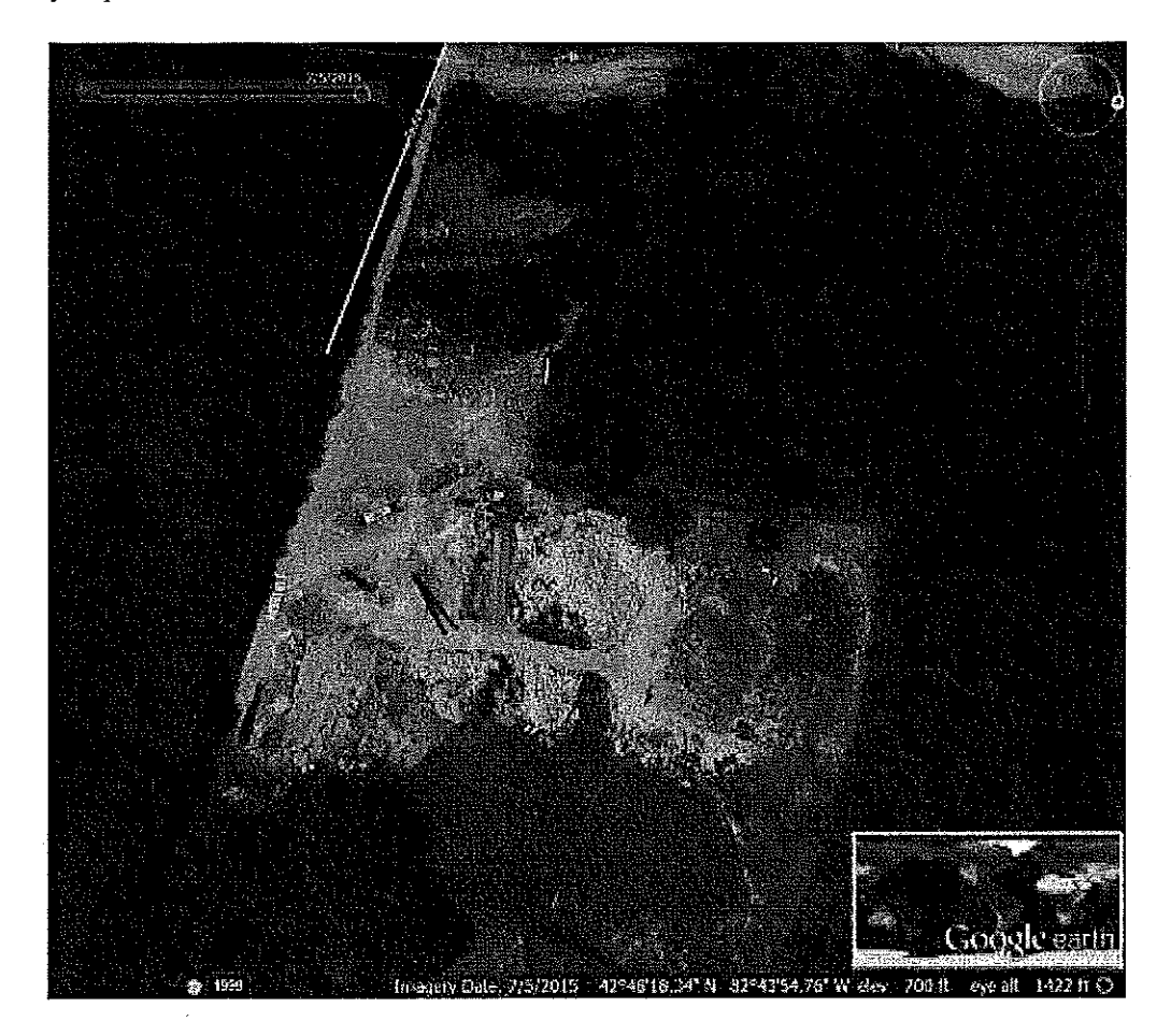
Image 4(July 5, 2015): Google Earth aerial photo dated July 5, 2015