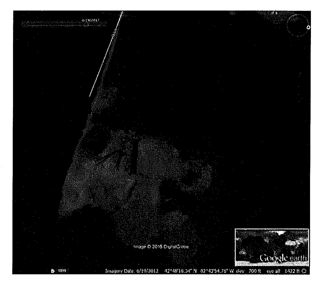
Image 2(June 19, 2012): Google Earth aerial photo dated June 19, 2012