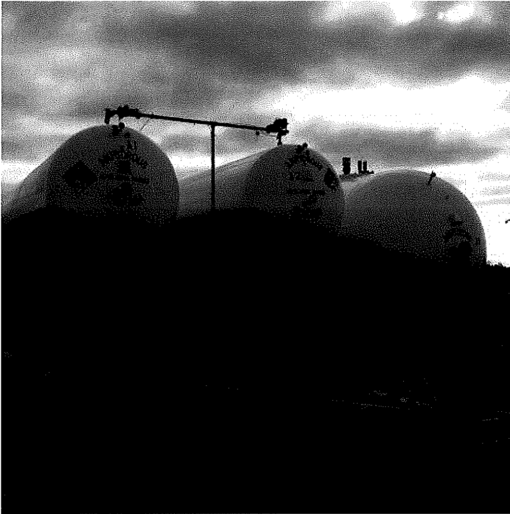
Image 1(004) : 6000 gallon, 6000 gallon, and 18,000 gallon permanent storage tanks

A request to void PTI 155-07 was submitted because the 30,000 gallon anhydrous ammonia storage tank has been removed from the facility.