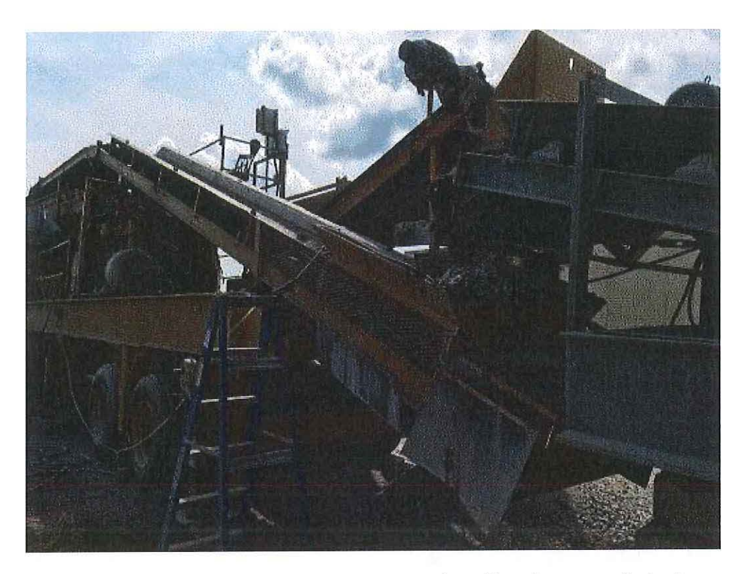
<u>Image 5(Conveyor)</u>: Conveyor into cone crusher with water spray attached.