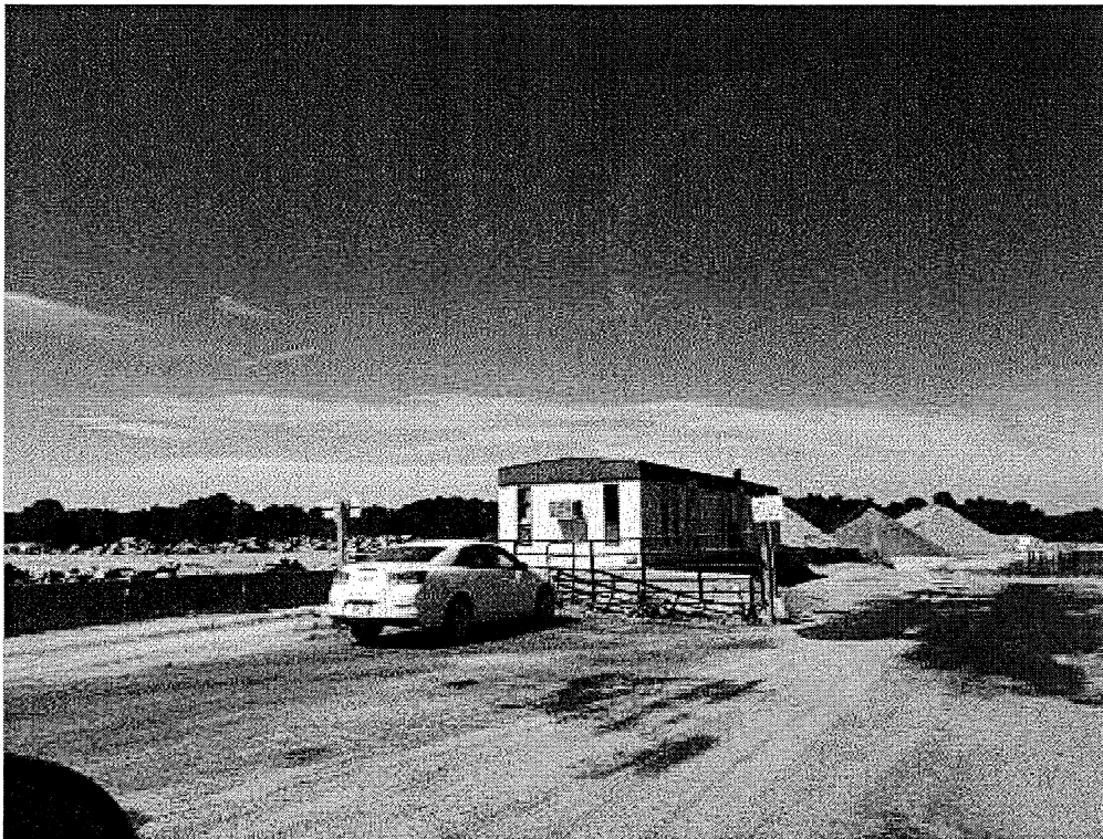
Image 2(Plant Office) : Photo showing plant office and distant piles of uncrushed concrete behind and to the left of the office.