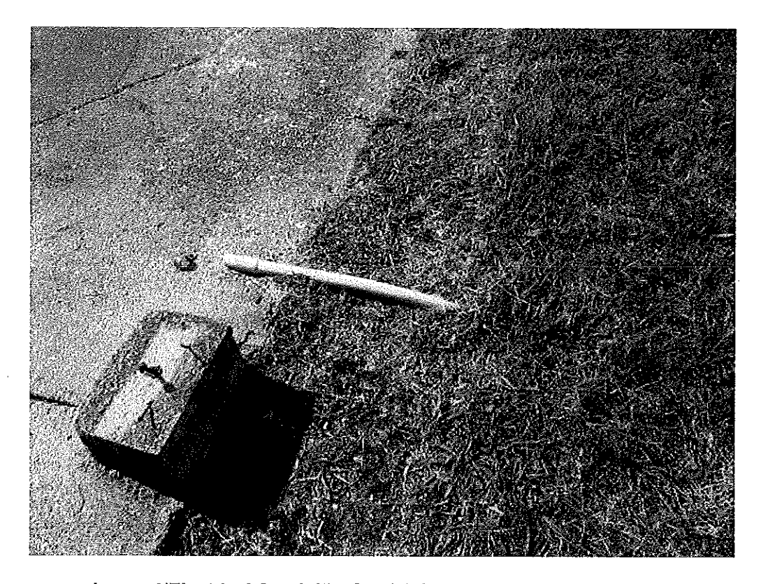
Image 4(Electrical Conduit): Conduit for electricity to power system.