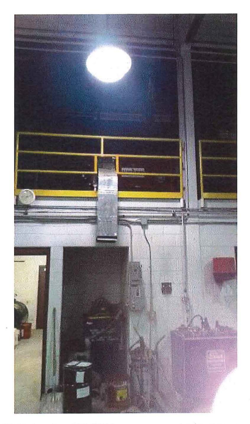
Image 2(CE3): Location of CB-2500 furnace on mezzanine in maintenance garage