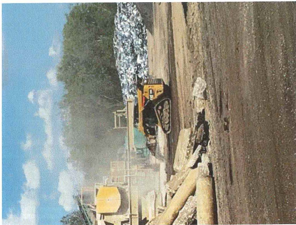
Image 3(Water Application) : Water application to unpaved plant yard to control dust from moving front-end loader. Note saturated ground

Image 2(Minimal Opacity) : Opacity the following day. Note plastic shielding is put into place at transfer point below crusher.