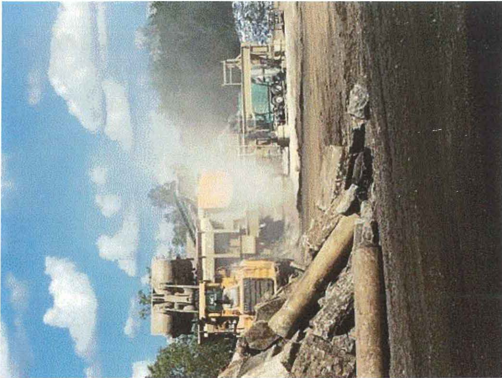
Image 1(Opacity Exceedance) : Opacity exceeding 10% limit from transfer point below crusher

Compliance Statement: Dynamic Crushing is in compliance with PTI 53-16 at this time.