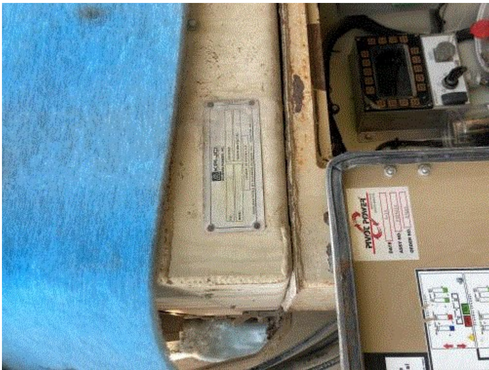
Image 1(Impact crusher) : KPI/JCI impact crusher face plate with serial number.

A Violation Notice will be issued to Mr. Greg Huyser of Dynamic Crushing for installation of a crushing plant without a Permit to Install.