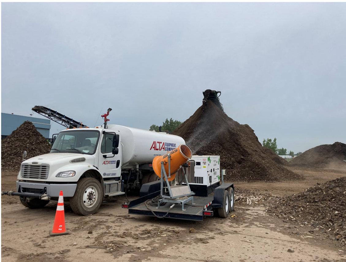
Water truck and Dust Boss in use