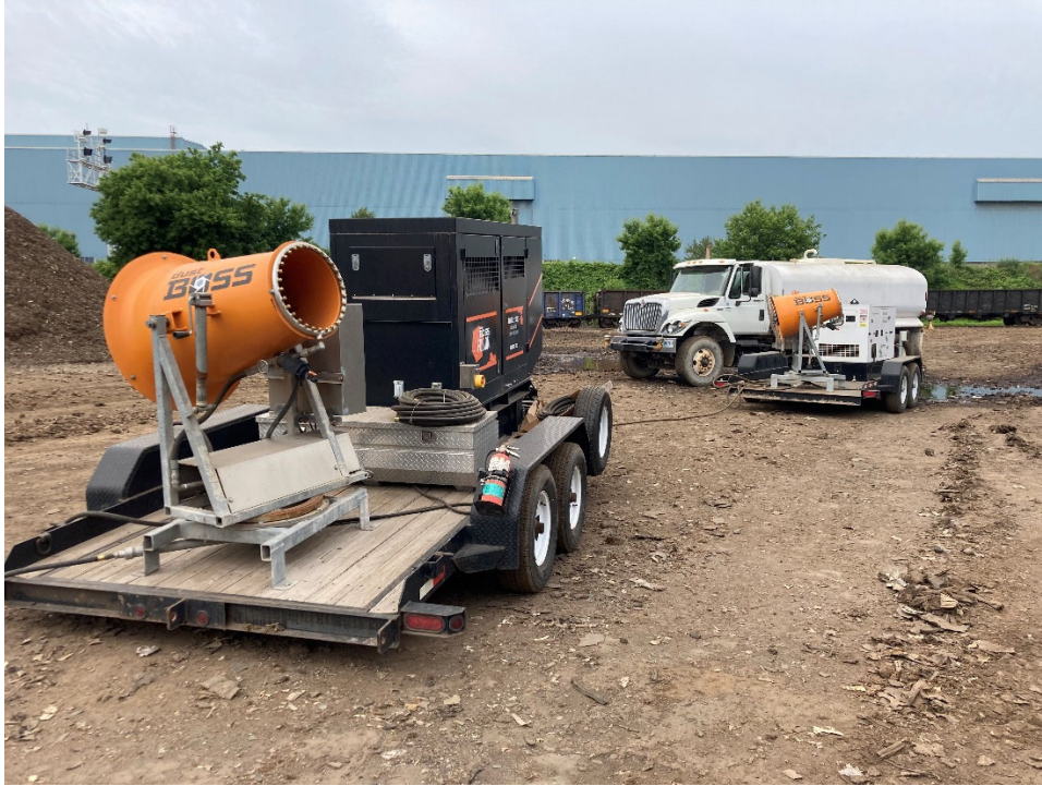
Photo of Dust Boss and water truck used to mitigate fugitive dust