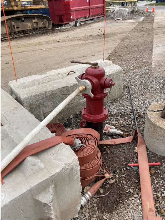
Temporary fire hydrant