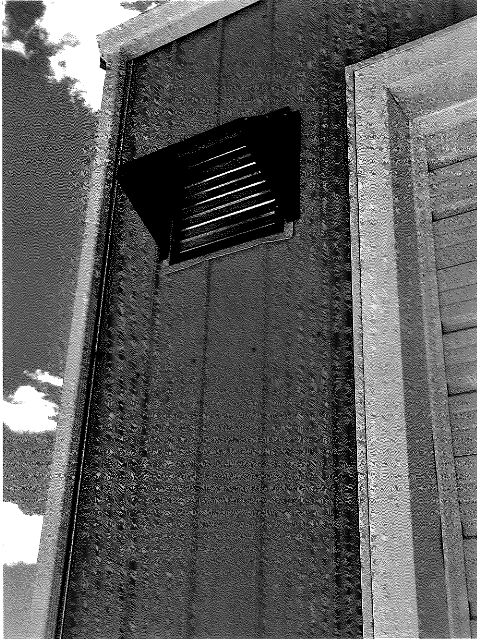
Outside vent - Note red color, not black or silver as complainant described