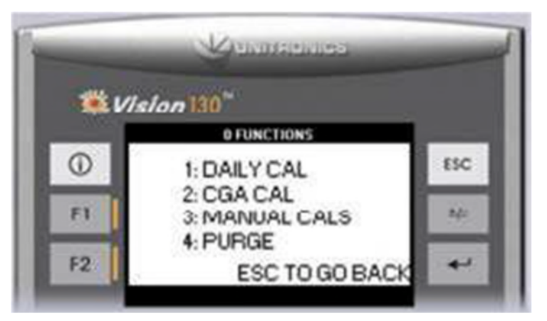
Figure 7. Function Selection Screen