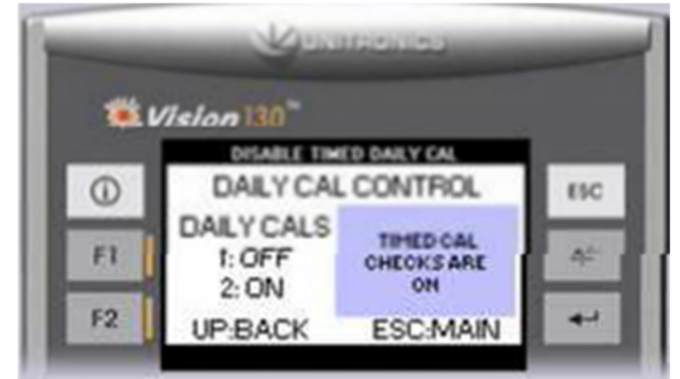
Figure 11. Daily Calibration Disable Screen