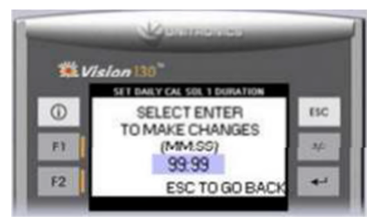
Figure 9. Daily Solenoid Duration Selection Screen

The time for each automatic daily calibration check is set to ensure that the calibration check is performed daily at the same time.