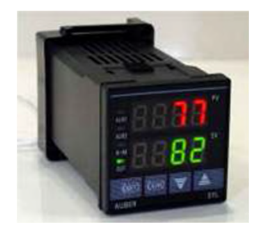
Figure 2. Auber Temperature Controller