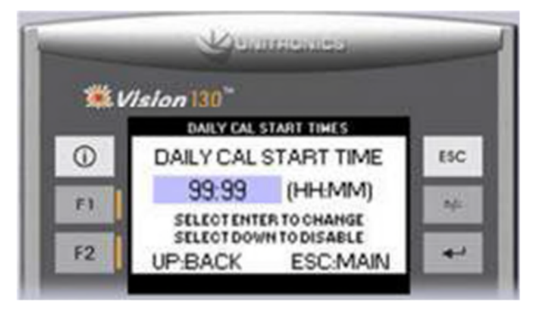
Figure 10. Daily Calibration Start Time Selection Screen

The time for each automatic daily calibration check is set to ensure that the calibration check is performed daily at the same time.