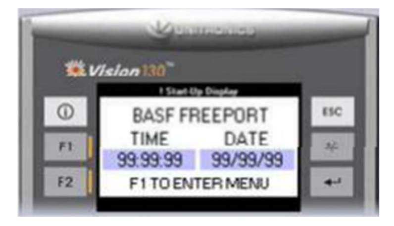
Figure 6. Operator Interface Controller Main Screen