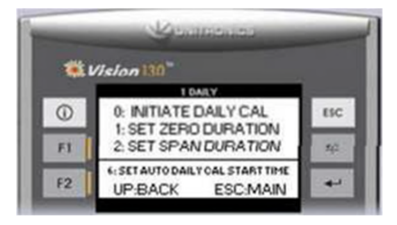
Figure 8. Daily Calibration Check Selection Screen