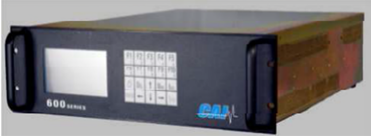
Figure 3. Front Face, CAI Model 600-HFID THC Analyzer