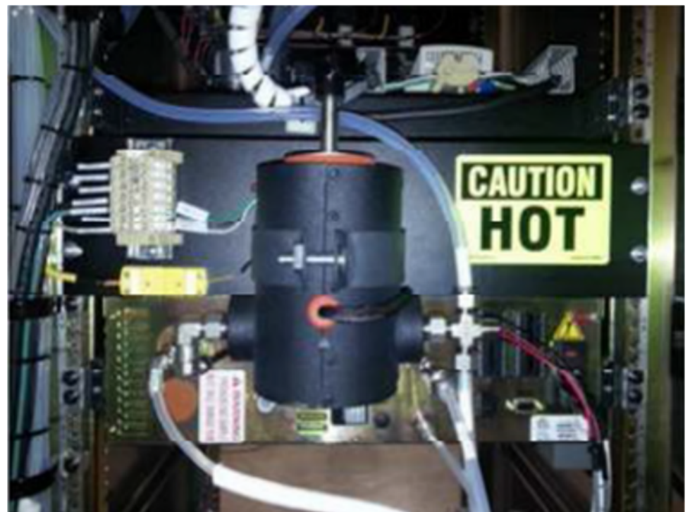
Figure 4. THC Heated Filter Assembly (Internal)