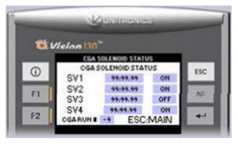
Figure 12. CGA Solenoid Status Screen

Status of each solenoid, as well as the run number and remaining time for each solenoid will be shown on the CGA Solenoid Status screen during a CGA audit.