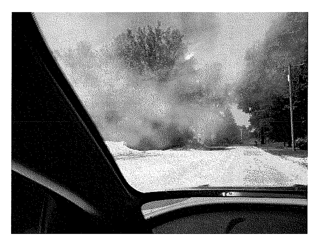
Image 4(High Grade) : Looking west. Dust from filling cement silo.