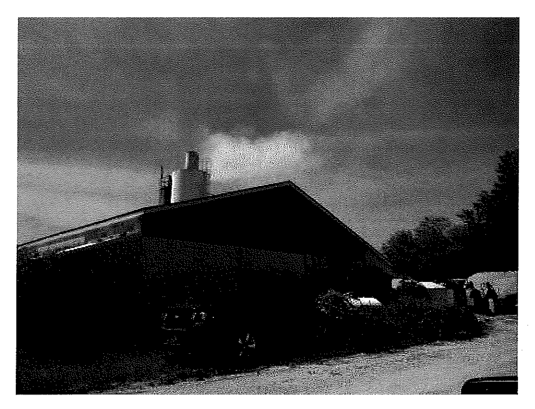
Image 2(High Grade) : Looking southwest. Dust from filling cement silo.